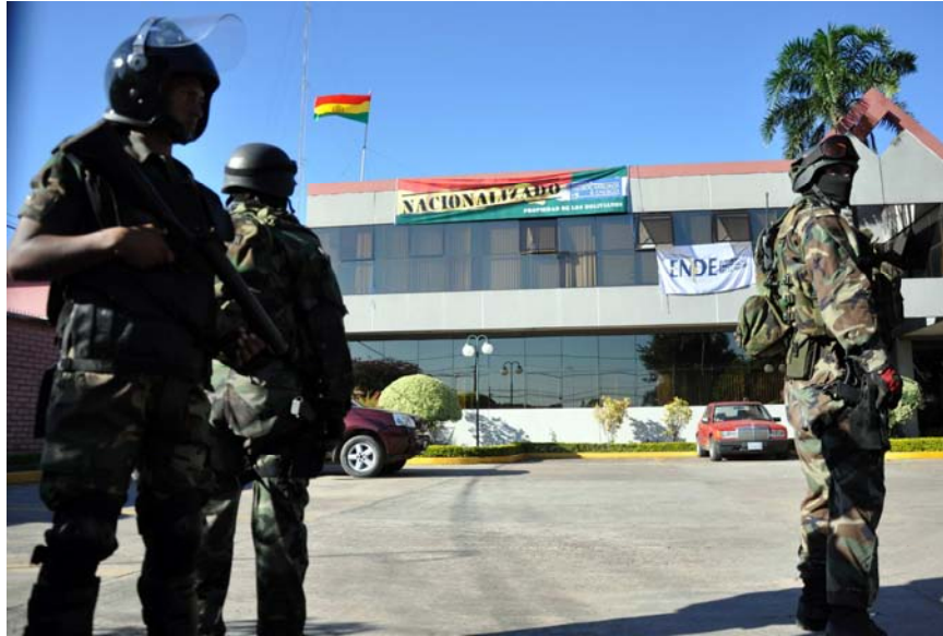
Nationalization of Guaracachi on 1 May 2010 154